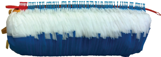
Bundle of Booties

Shoe Cover Refills for KineticButler Automatic Shoe Cover Dispensers