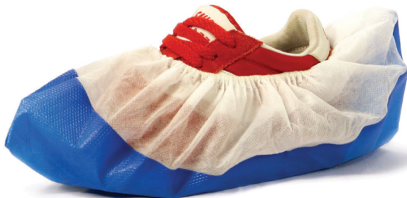
Shoe Cover Dimensions