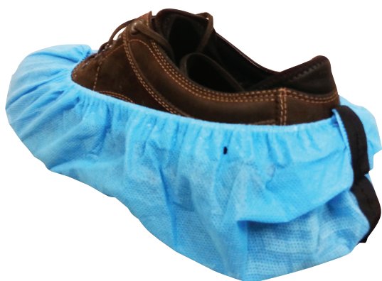
Shoe Cover Dimensions