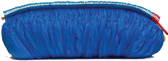
Bundle of Booties

Shoe Cover Refills for KineticButler Automatic Shoe Cover Dispensers