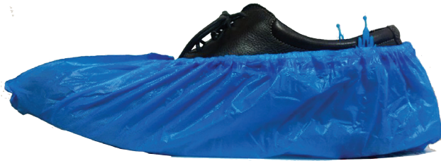
Shoe Cover Dimensions