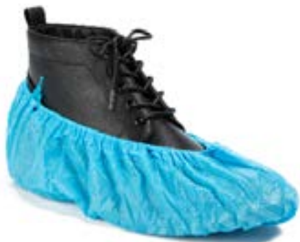
Shoe Cover Dimensions