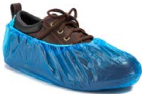
Shoe Cover Dimensions